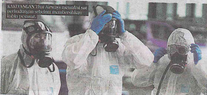
IKARITANGAN Thai Airways memakai sut perlindungan sebelum membersihkan kabin pesawat.

Terdapat 35,000 rakyat Malaysia di China di mana 25,000 daripadanya tinggal di Hong Kong, 2,500 daripadanya di Beijing manakala hanya 115 tinggal di Hubei.