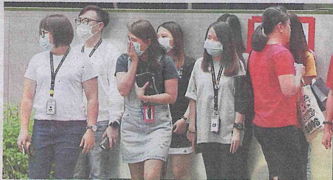
Keeping vigilant: People wearing face masks at a zebra crossing in Kuala Lumpur.

Quoting the US National Institute of Allergy and Infectious Diseases director Dr Anthoni S.