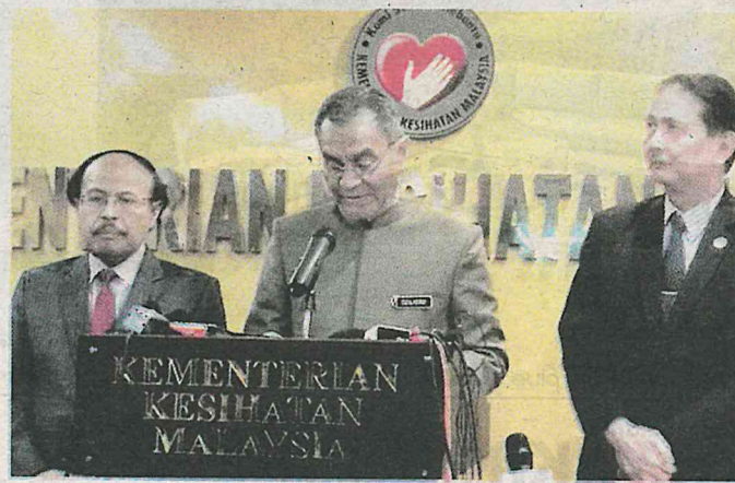
Dr Dzulkefly pada sidang akhbar di Putrajaya semalam mengenai situasi terkini jangkitan coronavirus.

“Setakat ini saya tidak diberitahu dan belum ada permintaan. Sekiranya ada Wisma Putra akan memaklumpkannya kepada media,” kata beliau pada sidang akhbar di Putrajaya di sini semalam mengenai situasi terkini jangkitan coronavirus.