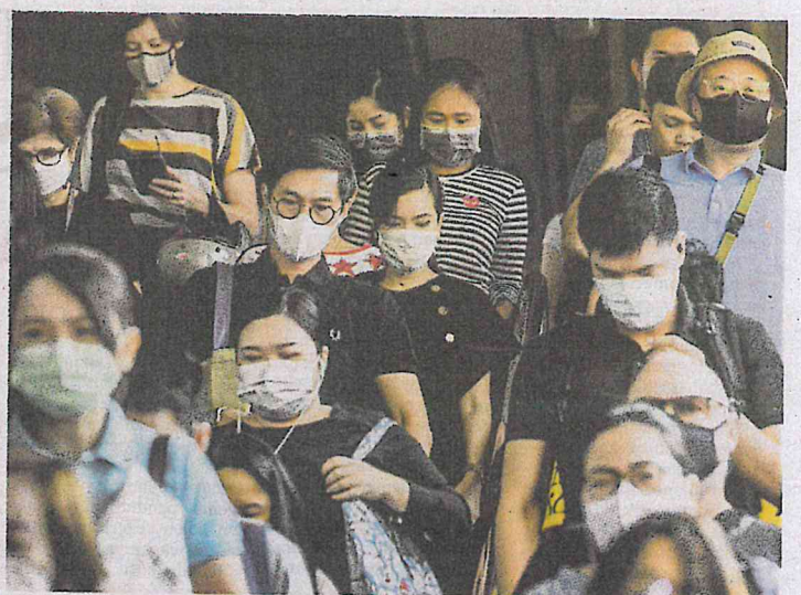
ORANG ramai memakai topeng muka ketika menaiki komuter di Bangkok, Thailand.