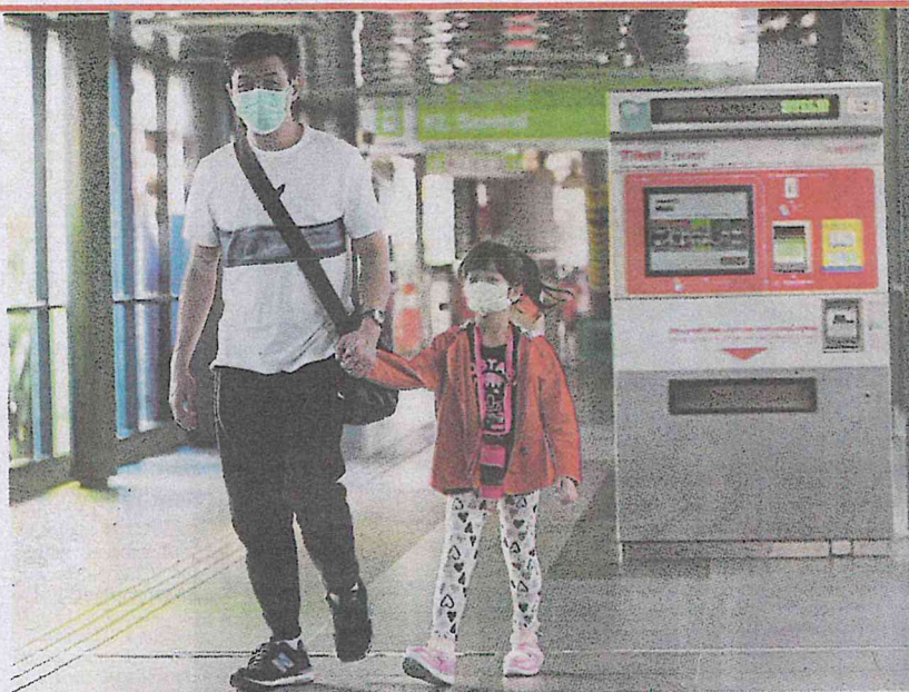
People wearing face masks at an LRT station in Kuala Lumpur. The World Health Organisation has declared the 2019 novel coronavirus outbreak a Public Health Emergency of International Concern.

The Health Sector of Asean, together with its counterparts from China, Japan and South Korea, said it had mobilised regional co-operation mechanisms to respond to the rapidly-evolving threat of the coronavirus since the first cluster of unexplained pneumonia cases was reported in