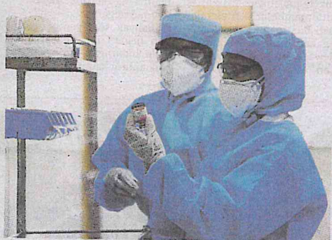
PASUKAN perubatan ketika meronda wad yang menempatkan pesakit dijangkiti coronavirus baharu di Hospital Rajiv Gandhi, Chennai, India.