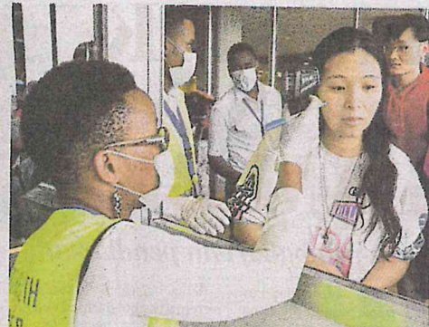
PASUKAN perubatan Tanzania mengambil suhu pelancong dari China di Lapangan Terbang Antarabangsa Kilimanjaro.