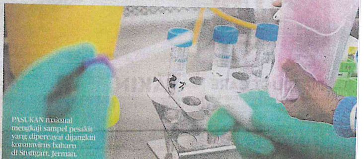
PASUKAN makmal mengkaji sampel pesakit yang dipercayai dijangkiti koronavirus baharu di Stuttgart, Jerman.