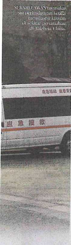
SUKARELAWAN memakai suit perlindungan ketika membasmi kuman di sekitar perumahan di Tai'zhou, China.